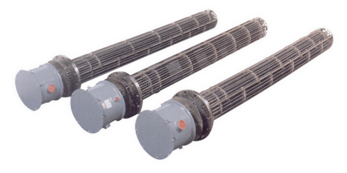
Figure 2. Thermon CX immersion heaters.

Engineered for easy installation, these immersion heaters can be attached directly into existing vessel ports, and come in a variety of standard sizes, and can be made into custom sizes as well. Thermon differs from any electric heater manufacturer globally, by offering third-party validation of the design via HTRI, CFD analysis and scientific testing.